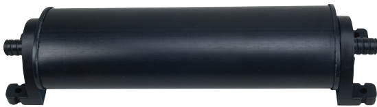
Without Heat Shield

Hose clamps must used in accordance with ABYC Fuel System Vent Hose Clamping Standards (H24 Table 3). The clamp must not distort the fitting on the canister when tightened. Leak test system per CFR33 requirements. Canister may not be pressurized to more than 5 psi.